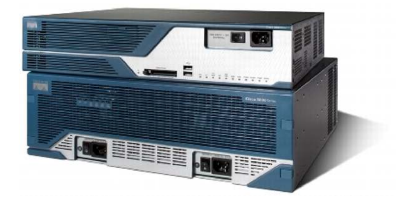
Figure 1. Cisco 3825 and 3845 Integrated Services Routers

The Cisco 3800 Series Routers feature embedded security processing, generous performance, high memory capacity, and high-density interfaces that deliver the performance, availability, and reliability required for scaling mission-critical security, IP telephony, business video, network analysis, and web applications in the most demanding enterprise environments. Built for performance, these routers deliver multiple concurrent services up to wire-speed T3/E3 rates.